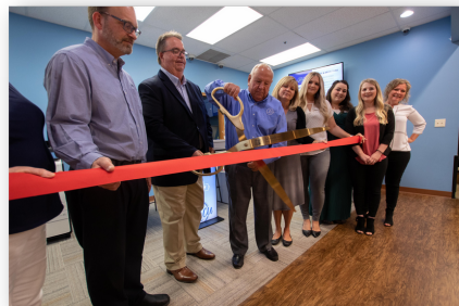
Ribbon Cutting Ceremony for Limestone Federal Credit Union