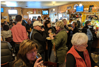
Third Thursday Networking Event located at Wheaty's Pub