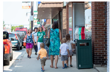
STC Hosted Community Events Manistique Makers Market